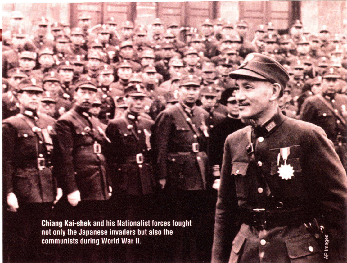
Chiang Kai-shek and his Nationalist forces fought not only the Japanese invaders but also the communists during World War II.

During the Yalta conference, Roosevelt reportedly begged Stalin to enter the war against Japan. Russia did finally enter the war — six days before its end and three days after the atomic bomb devastated Hiroshima. Huge stores of Japanese arms in Manchuria were immediately turned over to Mao’s forces. When the war against