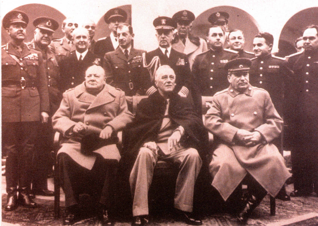
Betrayal at Yalta: At the wartime Yalta summit attended by the "Big Three" — Churchill, Roosevelt, and Stalin — Roosevelt's agreement to give the Soviet Union control of post-war Manchuria proved to be a tremendous boost to Mao and an equally tremendous blow to Chiang.

All during the war, Chinese communists devoted as little as 30 percent of their effort against the Japanese and the remaining 70 percent against the Nationalist Chinese. Instead of assisting Chiang, who had been officially