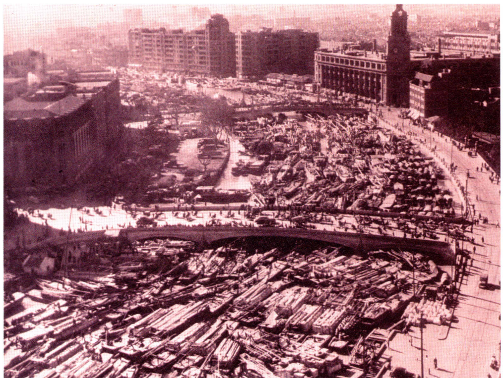
Sampans filled with refugees fleeing the advancing communist troops squeeze together near the mouth of the Yangtze river in 1948. The following year, Chiang Kai-shek's army and as many refugees as could make the journey evacuated to the island of Formosa (now Taiwan), where the Republic of Free China flourished.

Chiang died in 1975 still contending that he, not the bloody-handed communists whom pro-communist American diplomats had ushered into power, was China's true leader. ■